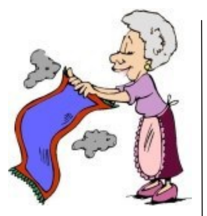
This Joint Is Getting To Me

Arthritis Can Make Daily Activities A Real Pain For Seniors